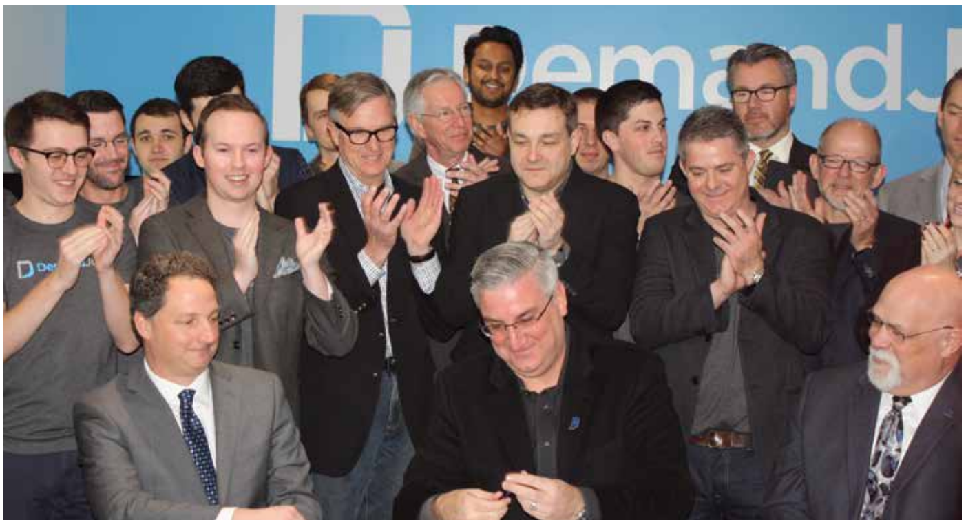
The Indiana Chamber saw the software-as-a-service clarification bill through from inception – the language originated in a Chamber policy committee – to conclusion with Gov. Eric Holcomb signing the measure into law.

NOTE: One policy we continue to actively engage on when needed – sales tax on services – was once again not even introduced in legislation. This is in part due to our dogged efforts explaining to those interested in this matter why it is bad for Indiana's tax climate. Sales tax on services would be very detrimental and harm our overall attractive tax structure.